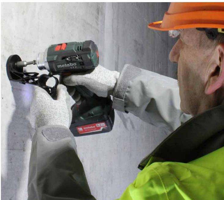
Mounting the CLIC SKH directly on the tunnel wall.

One "click" and the secure locking mechanism ensures that the radiating cable clamp will not open under any circumstances, even under impact and torsional loads.